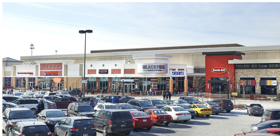
CBL acquired a vacant Sears store at Brookfield Square Mall in Brookfield, Wisconsin, earlier this year. The retail REIT is finalizing redevelopment plans at the property.