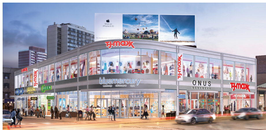
At the corner of Clark Street and Diversey Parkway in Chicago, Acadia Realty Trust is tearing down an existing building to make room for a new 30,000-square-foot retail property. Completion is slated for 2018.