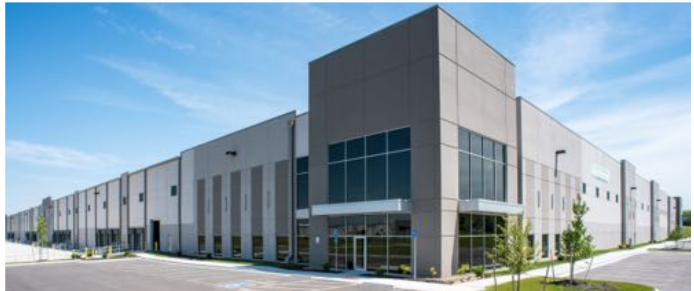
Lone Elm 716, developed by VanTrust Real Estate and located in Olathe, Kansas, is currently in the lease-up phase. The Class A property includes two buildings spanning 716,000 square feet.

KCADC works with site selection consultants as well as companies in these specified industries to present